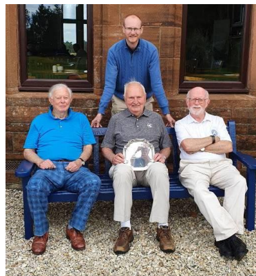
Thomas Telford Trophy 2022 Veterans