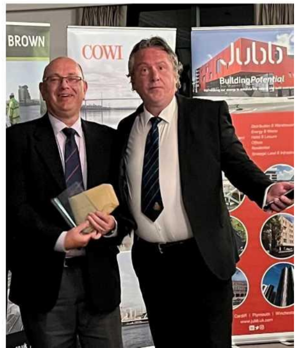
Foursomes Winner - North West

The Thomas Telford Trophy itself has been a two-horse race between Northern Ireland and the North East every year since 2014 and despite the tough scoring this year proved no different. With a score of 174 points, North East clinched the title for the 9 th time with Northern Ireland a close second on 173 points falling just short of a hat trick of wins. Special mentions go to Team South West (172 points) and Team Wales (171 points) who ran them very close on a challenging day.