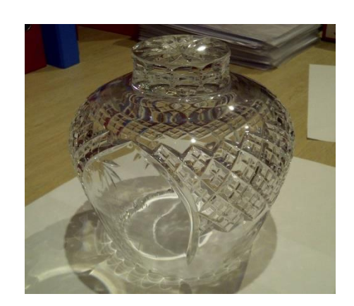
The Brunel Trophy

Next year's event will be held on Friday 6 October 2023 again at the Institution of Civil Engineers, 1 Great George St, SW1P 3AA. If you are interested in playing, please contact me nearer the day even if you don't have a team or a partner- if you let me know early enough I can usually find others to make up a team.