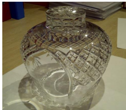
The Brunel Trophy