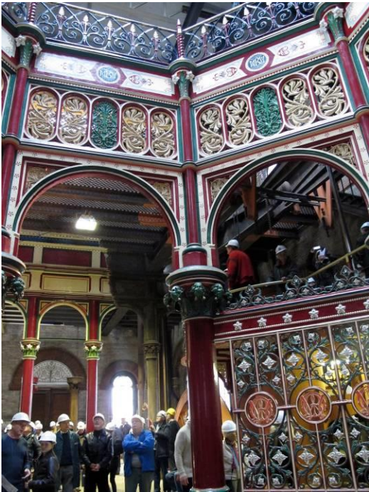
Crossness Pumping Station

21 st October 2012 – This was an additional event where the walk was preceded by a visit to the Crossness Pumping Station which was holding the last open day of 2012 with steam. The venue is well worth a visit and we were able to see a beautifully renovated beam engine operating and compare it with the other three rusty engines. The walk started from Lesnes Abbey Woods with 9 walkers taking a path through the grounds and woodland to join the Green Chain Walk which we followed through Bostall Heath, Bostall Wood and Plumstead Common down to the Thames Barrier.