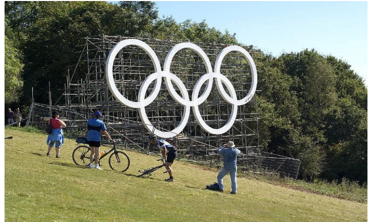
The Olympic Rings