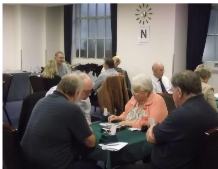
During play in the Palmer Room at ICE