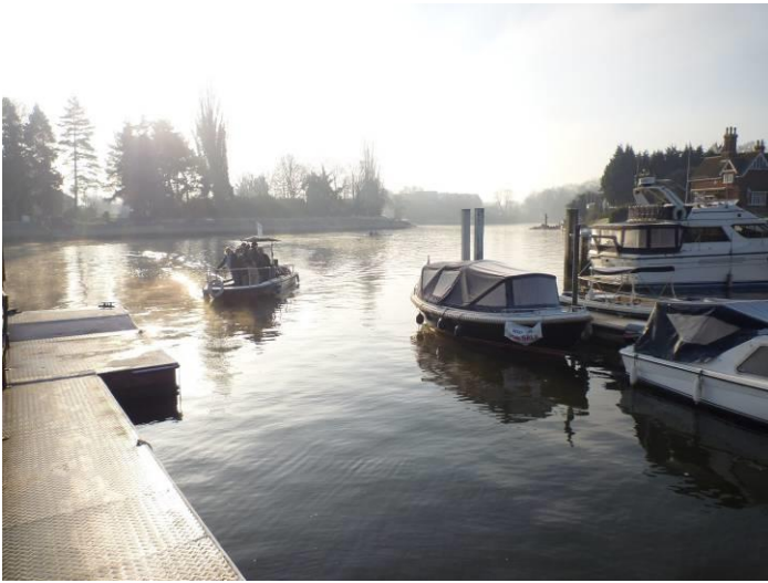
On the way to Chertsey

14 th January 2012 - The walk started from Elmbridge Canoe Club Car Park near Woking taking the riverside path to the ferry and crossing to the north bank. The route followed the path upstream to Chertsey Bridge where we crossed to the opposite bank. We followed the riverside path downstream before heading across the field and through woods to the reach the Wey Navigation with its lock. We continued along the canal before crossing a bridge and taking a path to the "Old Crown" for lunch. In the afternoon we walked down river to and around Desborough Island before returning to the car park.