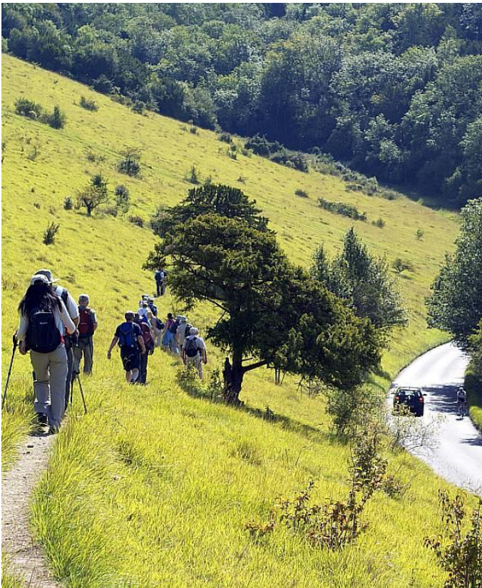
Descending to the zig-zag road