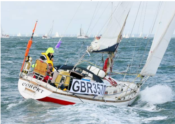
Cohort under full sail in the Solent...