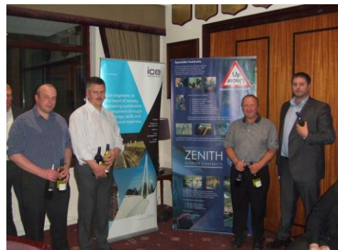
The Winning Birse 2 team