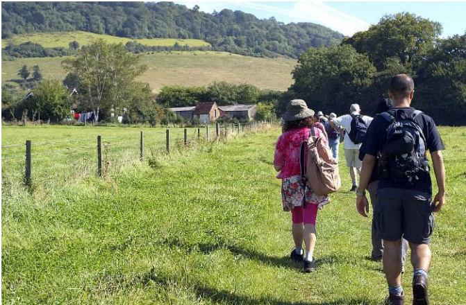
Approaching Lower Box Hill Farm

8 th September 2012 - The walk started from the Dorking Railway Station Car Park. We followed a footpath to the mill where we crossed the River Mole and continued past Lower Box Hill Farm and Boxhurst before ascending the Downs to join the North Downs Way. We quickly reached the viewing point where the Olympic Rings were displayed. After a short break we took a path through the woods along the top of the downs before descending to cross the zig zag road to take a track to the River Mole, which many of us crossed by stepping stones. After lunch at The Stepping Stones in Westhumble we took a path through Norbury Park, Chapel Farm and Denbies Vineyard back to Dorking Station.