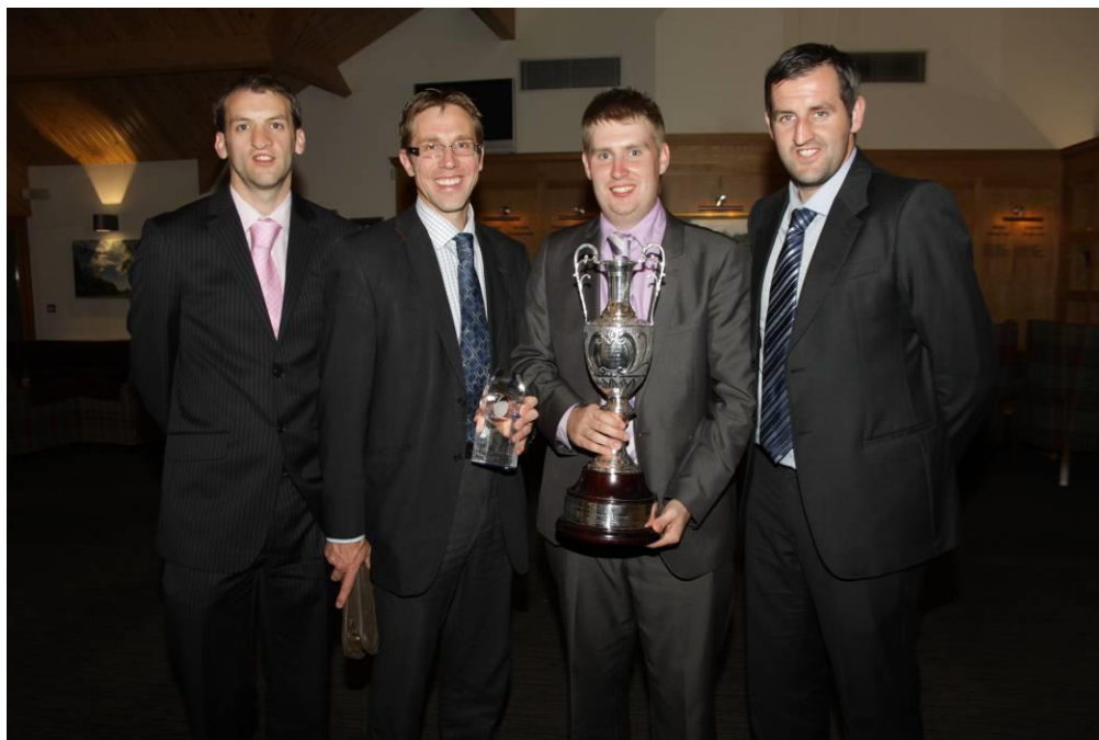
Thomas Telford Trophy Winners - West of Scotland