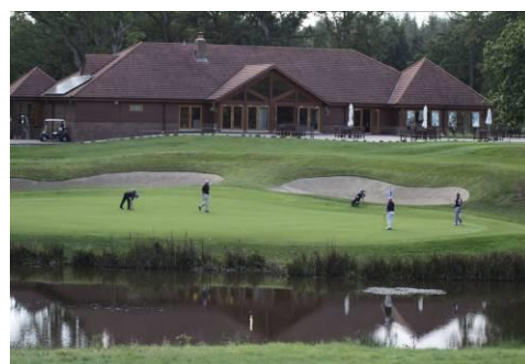
The 18 th green and Clubhouse