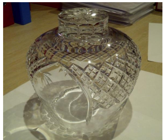
The Brunel Trophy