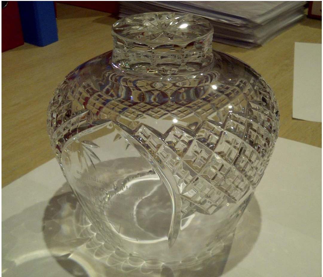
The Brunel Trophy