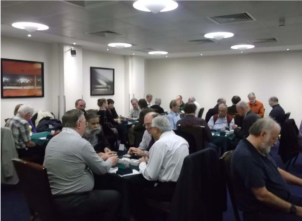
During the play in the Palmer Room at ICE