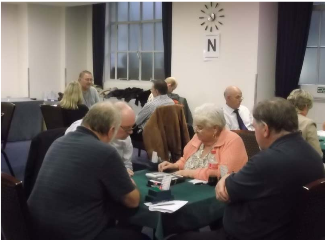
During the play in the Palmer Room at ICE