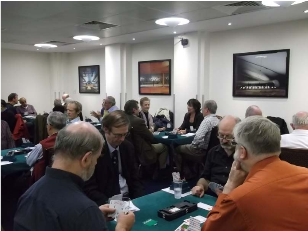
During the play in the Palmer Room at ICE