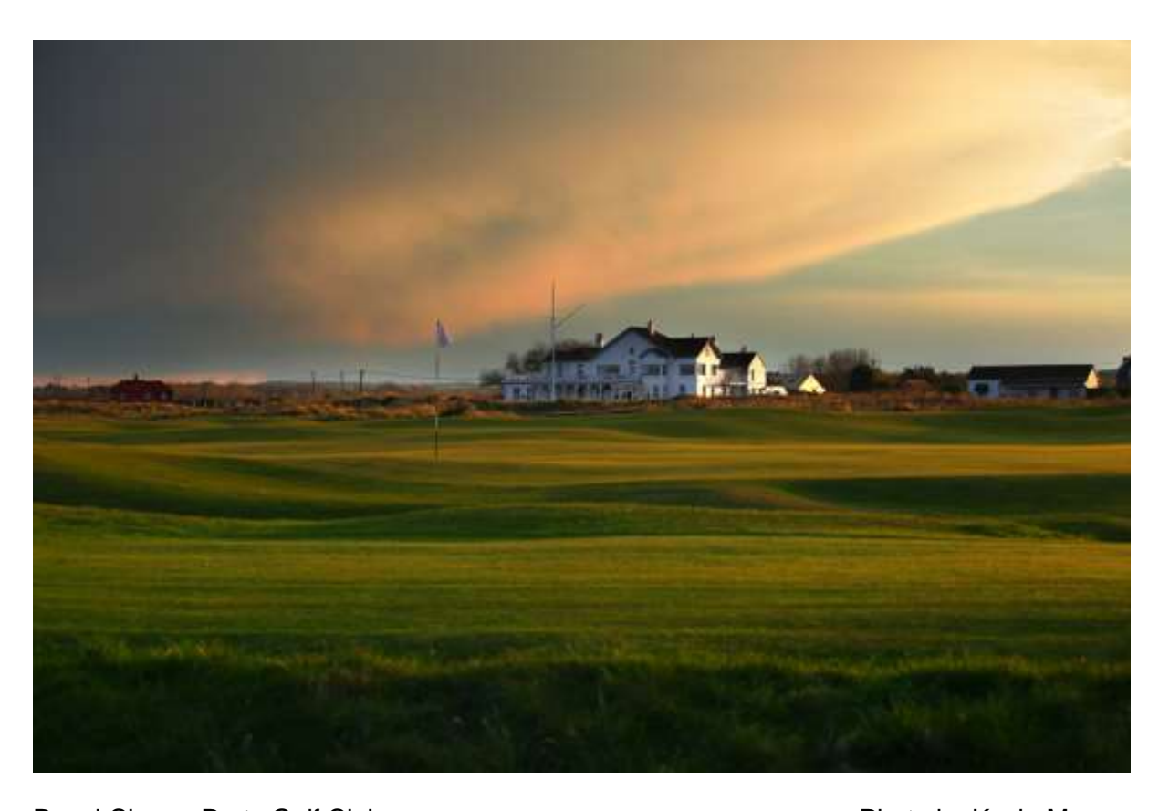
Royal Cinque Ports Golf Club