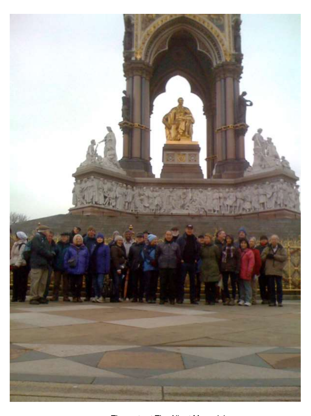
The party at The Albert Memorial