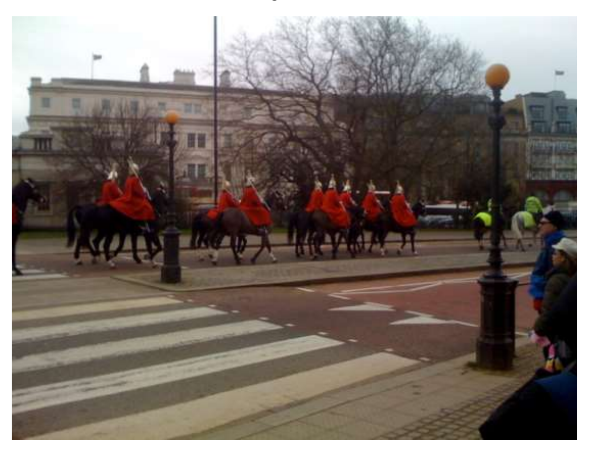
Hyde Park Corner