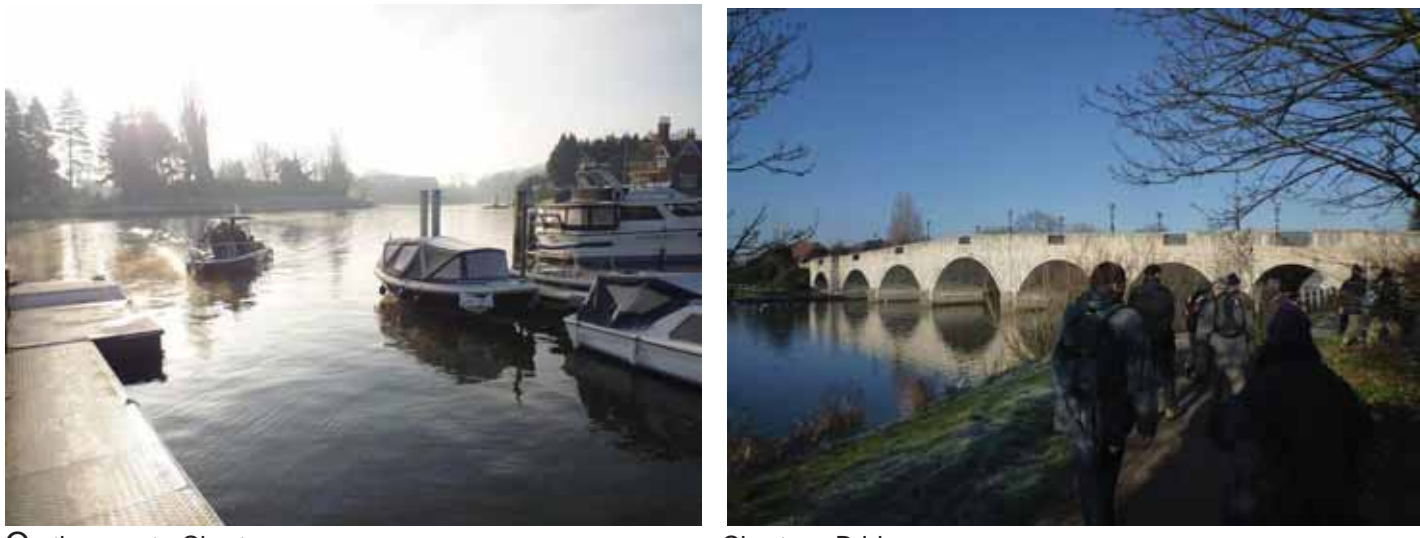
On the way to Chertsey

14<sup>th</sup> January 2012 - The walk started from Elmbridge Canoe Club Car Park near Woking taking the riverside path to the ferry and crossing to the north bank. The route followed the path upstream to Chertsey Bridge where we crossed to the opposite bank. We followed the riverside path downstream before heading across the field and through woods to the reach the Wey Navigation with its lock. We continued along the canal before crossing a bridge and taking a path to the "Old Crown" for lunch. In the afternoon we walked down river to and around Desborough Island before returning to the car park.