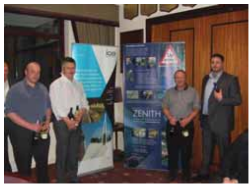
The Winning Birse 2 team