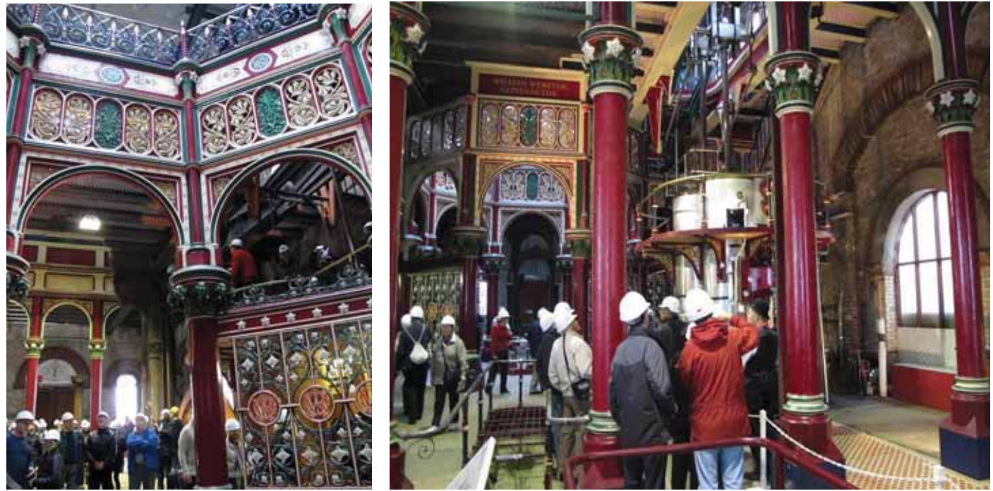
Crossness Pumping Station

21<sup>st</sup> October 2012 – This was an additional event where the walk was preceded by a visit to the Crossness Pumping Station which was holding the last open day of 2012 with steam. The venue is well worth a visit and we were able to see a beautifully renovated beam engine operating and compare it with the other three rusty engines. The walk started from Lesnes Abbey Woods with 9 walkers taking a path through the grounds and woodland to join the Green Chain Walk which we followed through Bostall Heath, Bostall Wood and Plumstead Common down to the Thames Barrier.