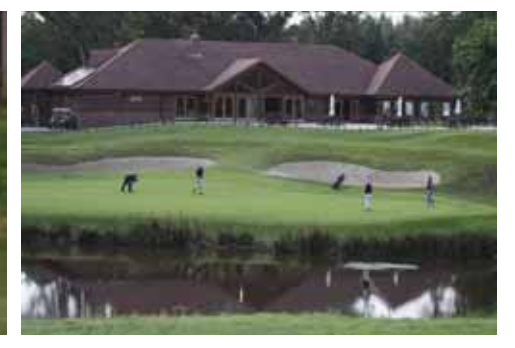
The 18<sup>th</sup> green and Clubhouse